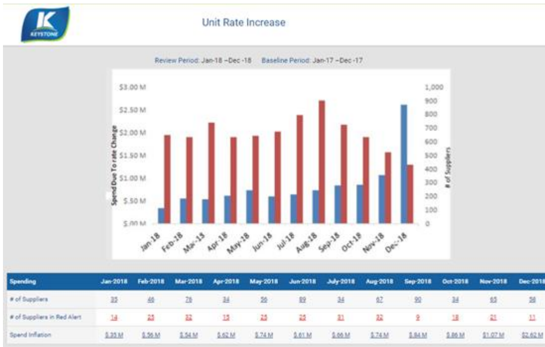
Control Tower – Unit Rate Inflation