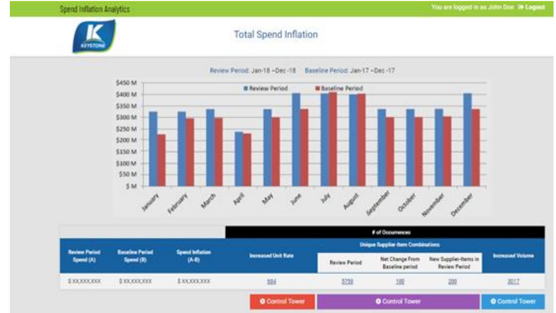
Total Spend Inflation